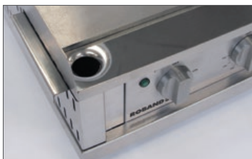
Forward positioned grease gutter