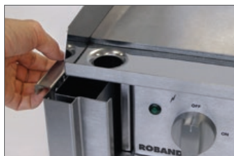
Integrated grease collection box