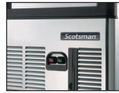
Front ON-OFF Switch Routine Maintenance Alarm